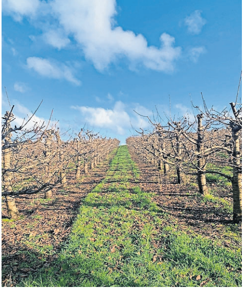
cherry orchard and rolling countryside; the orchard under sunny winter skies; soak up the views; king bed; cabin with firepit.